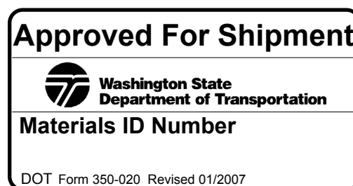
Figure 9-6 Tag

All documentation associated with the tag in Figure 9-6 will be reviewed and approved by the WSDOT Materials Fabrication Inspection Office and kept at the WSDOT Materials Fabrication Inspection Office and kept at the point of manufacture.