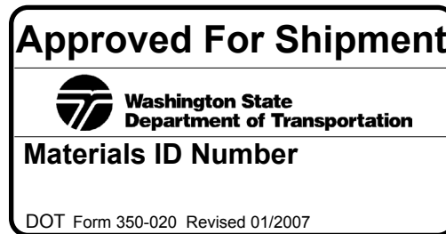
Figure 9-6 Tag

All documentation associated with the tag in Figure 9-6 will be reviewed and approved by the WSDOT Materials Fabrication Inspection Office and kept at the WSDOT Materials Fabrication Inspection Office.