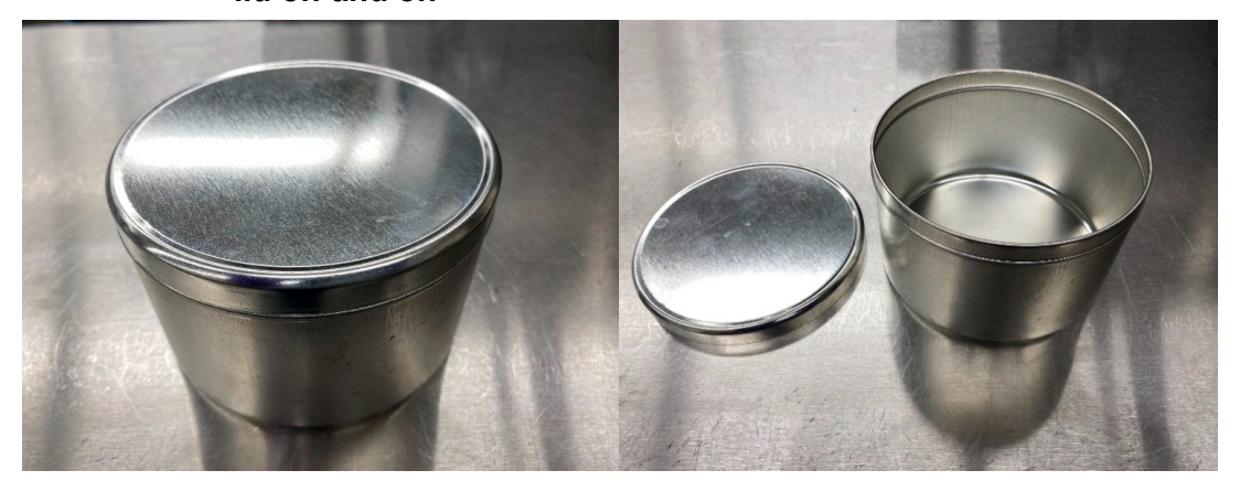
Figure 1 Pictures of acceptable 16 to 24-ounce aluminum container with lid off and on

WSDOT may independently test mix design samples for asbestos containing materials.