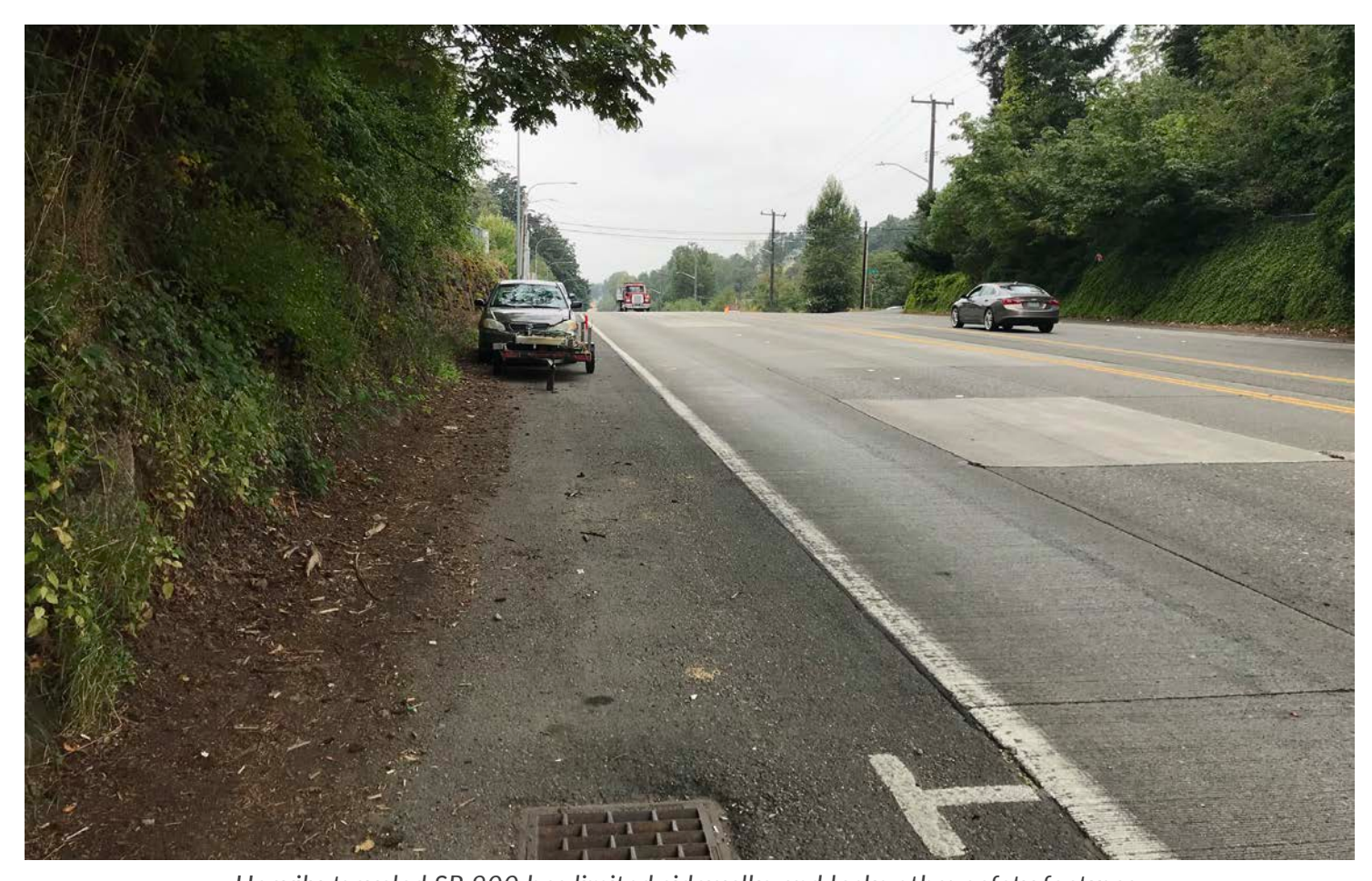
Heavily-traveled SR 900 has limited sidewalks and lacks other safety features.

Americans with Disabilities Act (ADA) Information: Accommodation requests for people with disabilities can be made by contacting the WSDOT Diversity/ADA Affairs team at wsdotada@wsdot.wa.gov or by calling toll-free, 855-362-4ADA (4232). Persons who are deaf or hard of hearing may make a request by calling the Washington State Relay at 711.