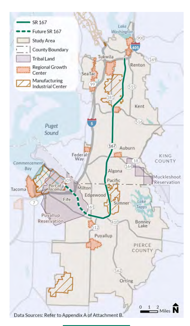
Figure 5. Study Area