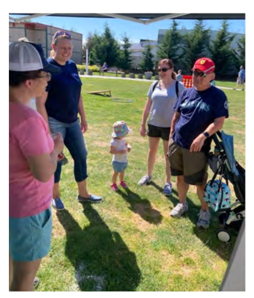
Team members discussed the project and answered questions from the community.