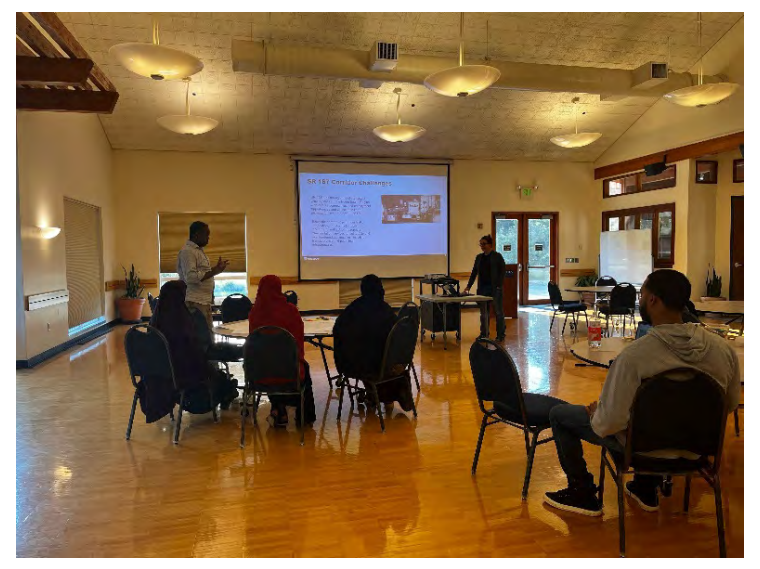
Attendees identified commute challenges along SR 167.