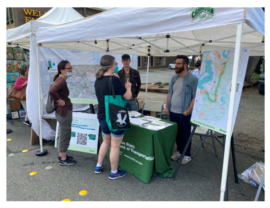
The event booths included display boards and printed information.